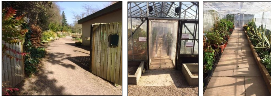
Butterfly House external, internal, all entrances