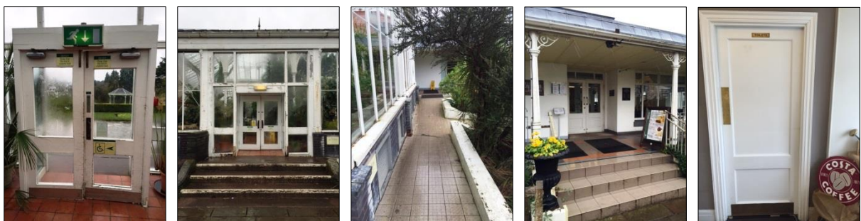
Subtropical House Exit to Loudon Terrace, Ramp to Pavilion Terrace, Pavilion Tearoom entrance, Pavilion Lavatory