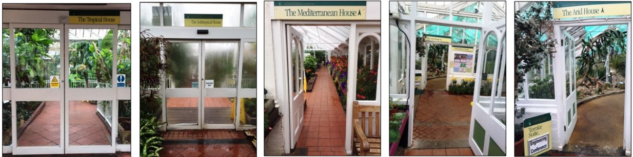
Entrances to Tropical House, Subtropical House, Mediterranean House and Arid House