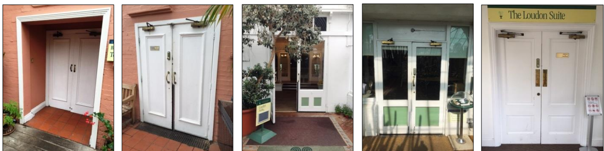
Entrances to Garden, Terrace and Loudon Suites