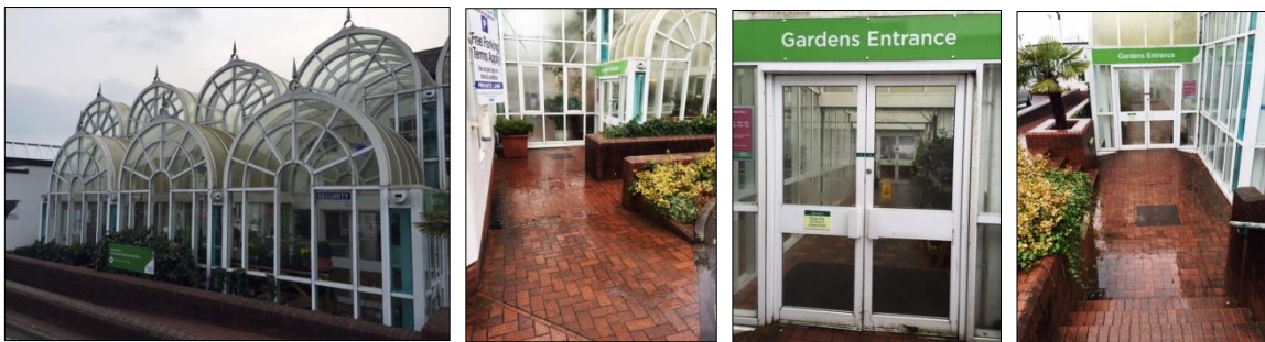
Main Entrance- external and internal, Reception Desk, Turnstile, Gate