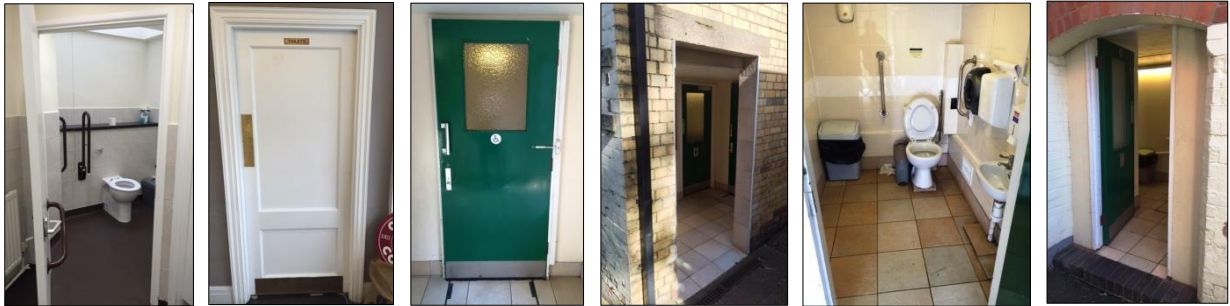
Entrance to lavatories: Entrance Concourse, Pavilion Tearoom, Loudon Terrace