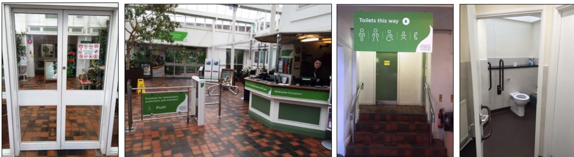
Entrance Doors, Main Reception Sales Desk, Turnstile and Gate, Toilets, Disabled Toilet