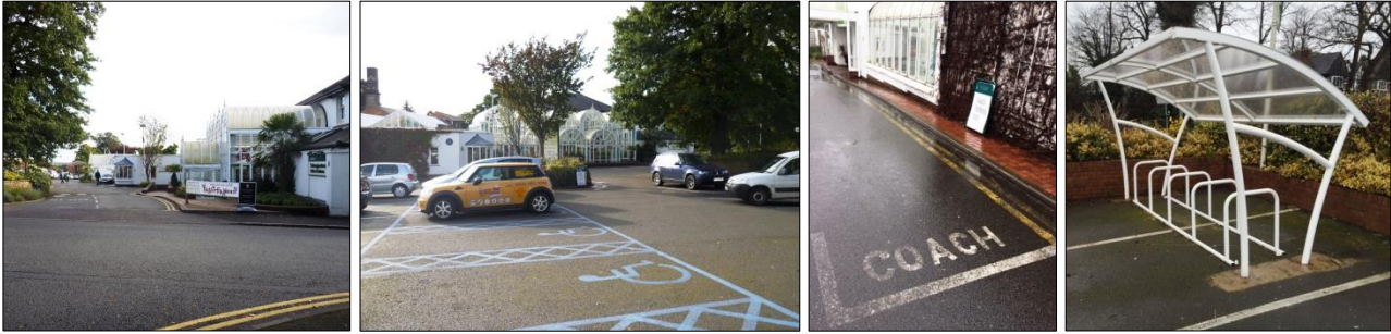
Car Park Entrance from Westbourne Road, Disabled Bays, Coach Bays, Bicycle Shelter