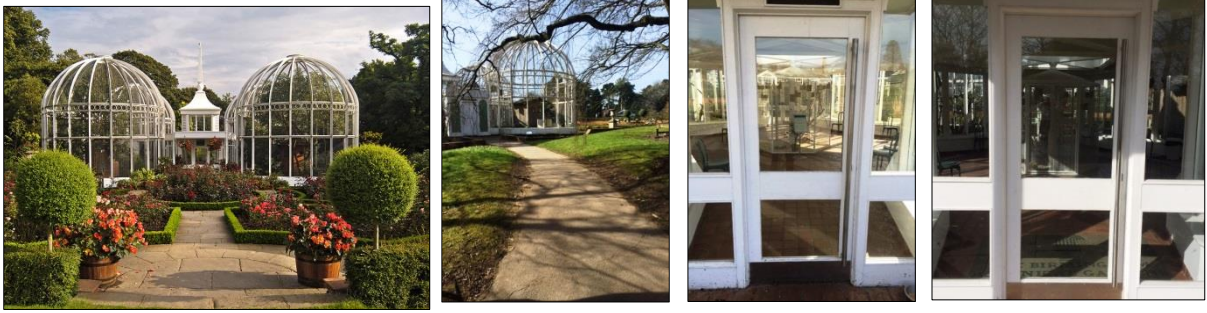
Lawn Aviary from Rose Garden, Sloping path access, Concourse Entrance North and South